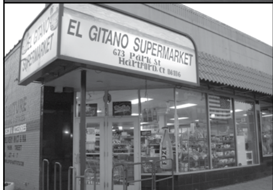
El Mercado (above) and El Gitano (below) are two grocery stores that have been barred recently from participation in the WIC program by state officials.